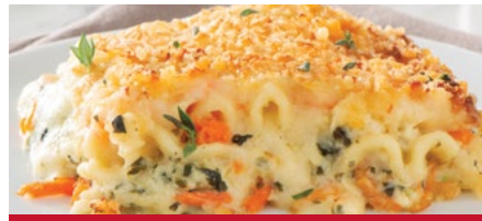
Garden Vegetable Lasagna