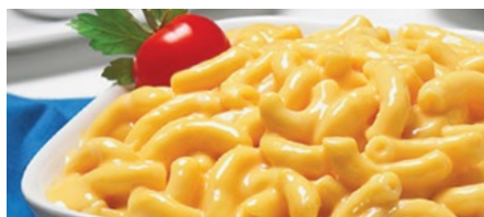
Macaroni & Cheese