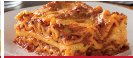
Lasagna Classico with Meat

4 x 2.61 kg (5.75 lb) 48 servings (12 slices per pan)