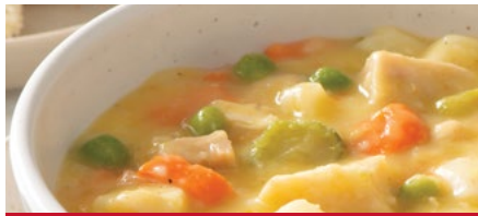
Hearty Chicken & Vegetables