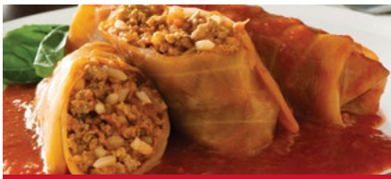
Stuffed Cabbage Rolls with Beef & Sauce

4 x 2.72 kg (6 lb) 48 servings (12 slices per pan)