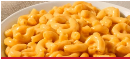
Deluxe Macaroni & Cheese