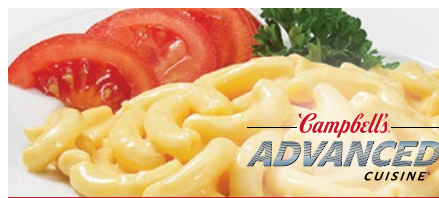
Macaroni & Cheese