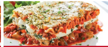
Whole Wheat Vegetable Lasagna

4 x 2.26 kg (5 lb) 48 servings (12 peppers per pan)