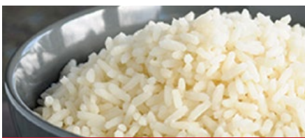
Cooked White Rice

4 x 2.52 kg (5.5 lb) 48 servings (12 slices per pan)