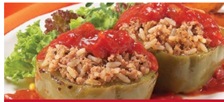
Stuffed Green Peppers

4 x 2.5 kg (5.5 lb) 48 servings (12 rolls per pan)