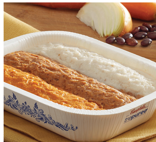
Trepuree® Vegan Bean Medley with Vegetables and Rice

All Trepuree varieties have a minimum of 14g protein and 600mg or less of sodium per 250g entree.