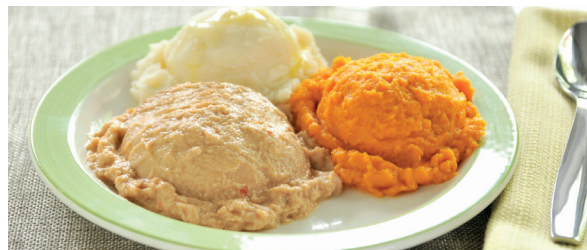
Made with Primepuree ® Roast Chicken and served with Honey Glazed Carrots made with Gardenpuree ® Sweet Carrots