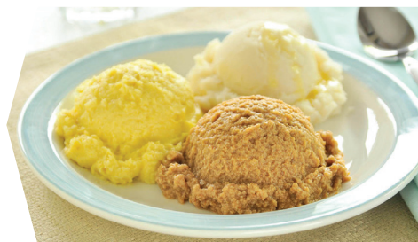
Primepuree® Chicken with Gardenpuree® Creamy Corn