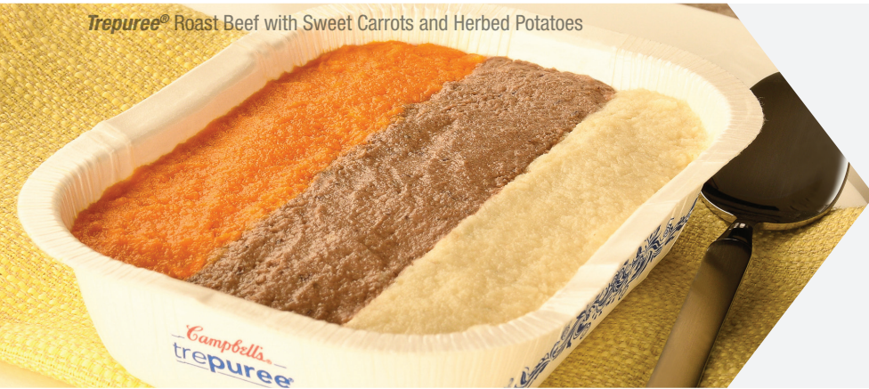
Trepuree ® Roast Beef with Sweet Carrots and Herbed Potatoes

DRIVEN BY TASTE • NUTRITION • VERSATILITY • CONSISTENCY