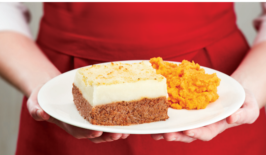
Shepherd's Pie made with Primepuree ® Roast Beef with Gardenpuree ® Sweet Carrots