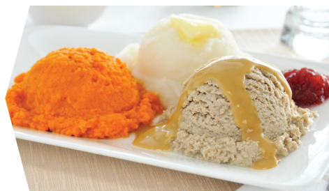
Primepuree® Roast Turkey with Gardenpuree® Sweet Carrots