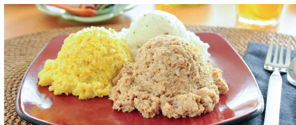
Minced BBQ Pork Chops made with Primeminced ® Roast Pork