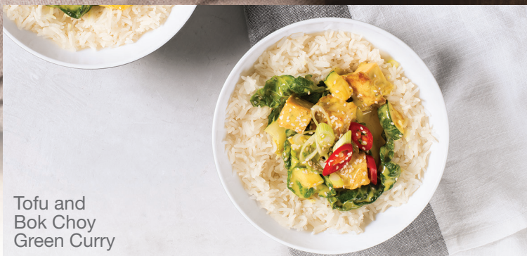
Tofu and Bok Choy Green Curry