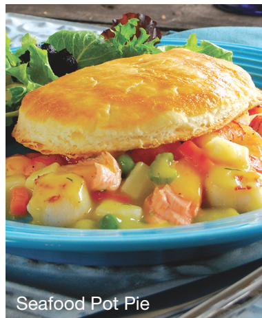
Seafood Pot Pie