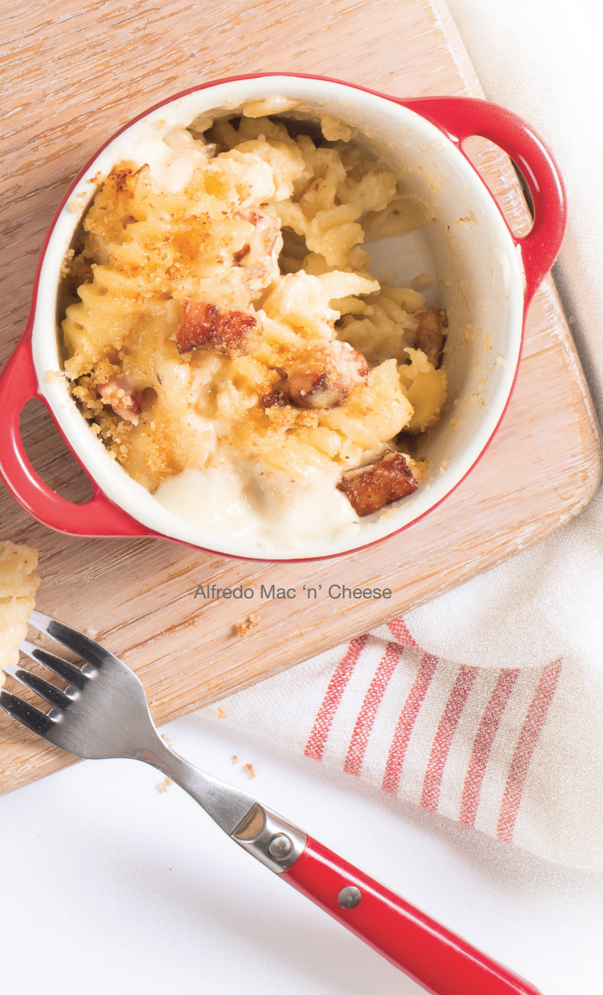
Alfredo Mac 'n' Cheese