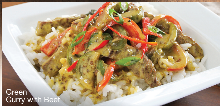
Green Curry with Beef