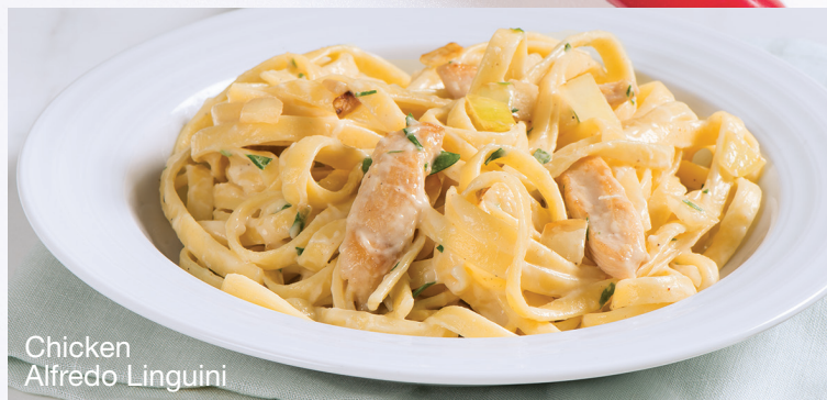
Chicken Alfredo Linguini