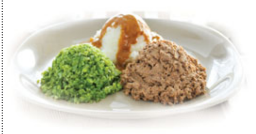
Primeminced® Roast Beef with minced green beans and mashed potato

Primeminced ® foods deliver all the benefits of protein, finely minced for maximum consumption and enjoyment. Every option is made from quality cuts of meat and poultry seasoned to perfection. Available in 5 varieties