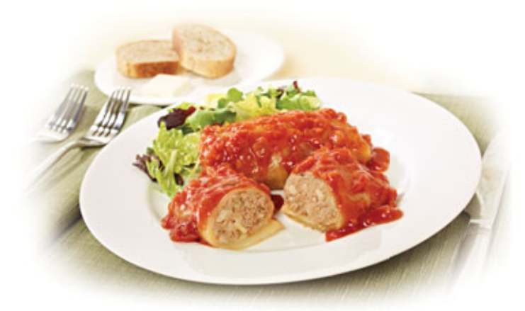
Campbell's® Stuffed Cabbage Rolls in Tomato Sauce

Campbell's® quality standards ensure consistency and dependable results in your kitchen, day after day, while the labour-savings of the convenient frozen format help you to manage food costs, serving by serving.