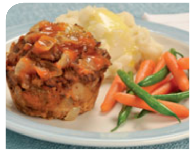
Onion crusted Meatloaf Muffins made with Campbell's® Classic Reduced Sodium Tomato Soup