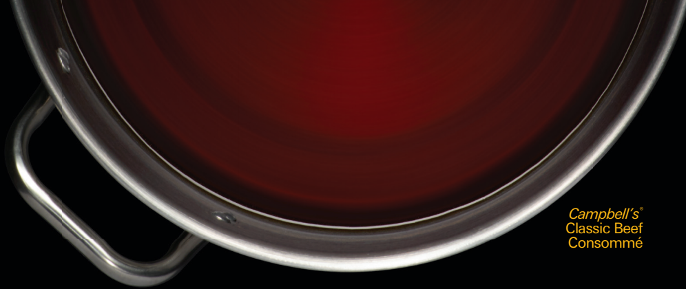
Campbell's® Classic Beef Consommé