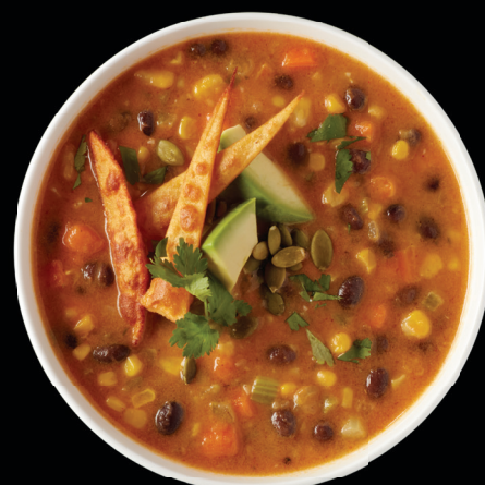
Creamy Pumpkin Chicken Tortilla Soup

Made with Campbell's Classic Cream Soup Base