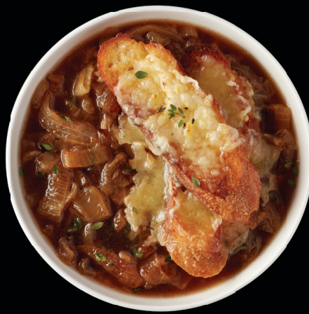
French Onion Soup