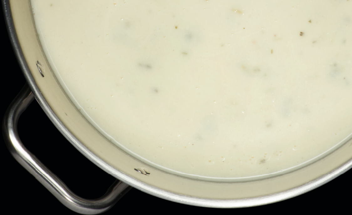
Campbell's® Classic Cream Concentrated Soup Base

Create custom soups simply by starting with our flavourful soup bases and adding a few ingredients. Try our wide range of classic and on trend authentic flavours.