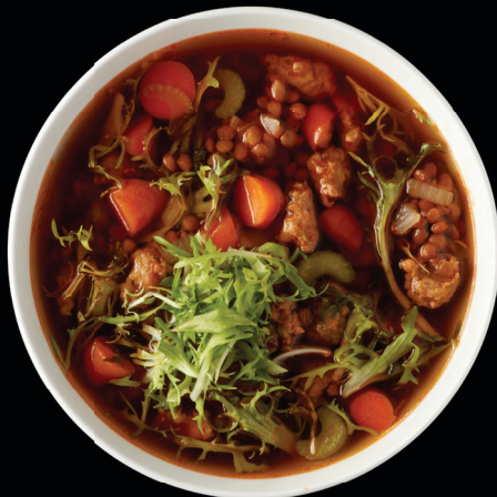
Lentil with Escarole & Sausage Soup