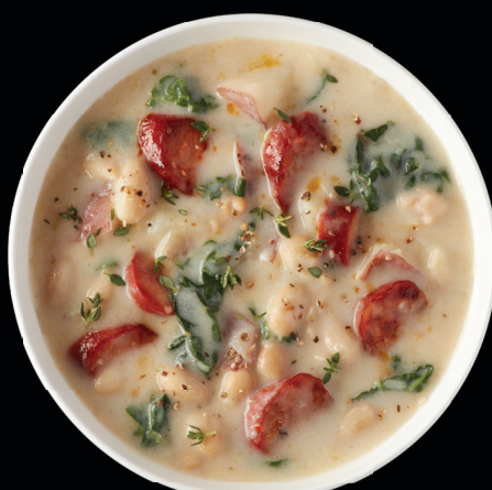
Chorizo, White Bean & Potato Soup