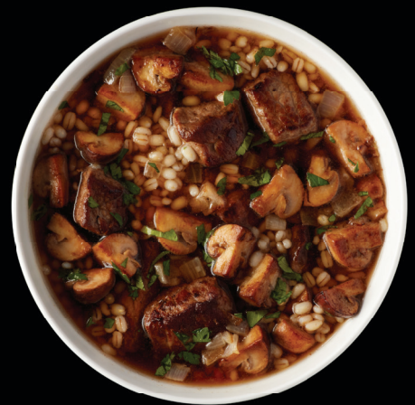
Roasted Beef, Mushroom & Barley Soup

Made with Campbell's Classic Beef Consommé