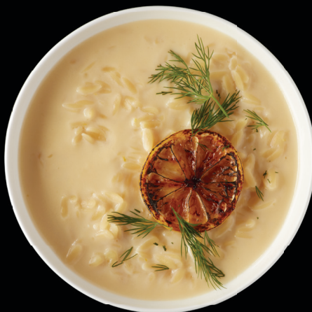
Greek Lemon Soup