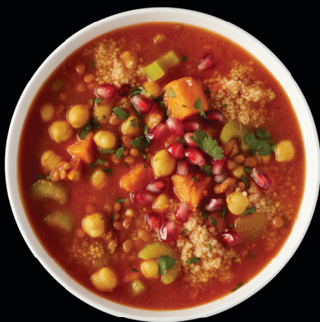
Sweet Potato & Chickpea Moroccan Style Soup