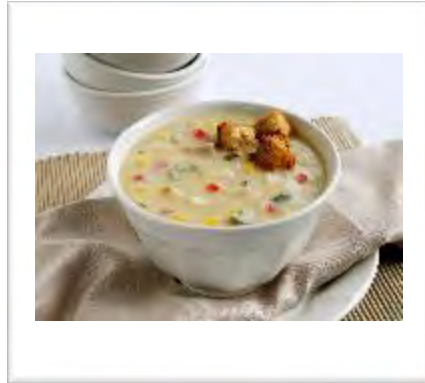
Chicken Corn Chowder